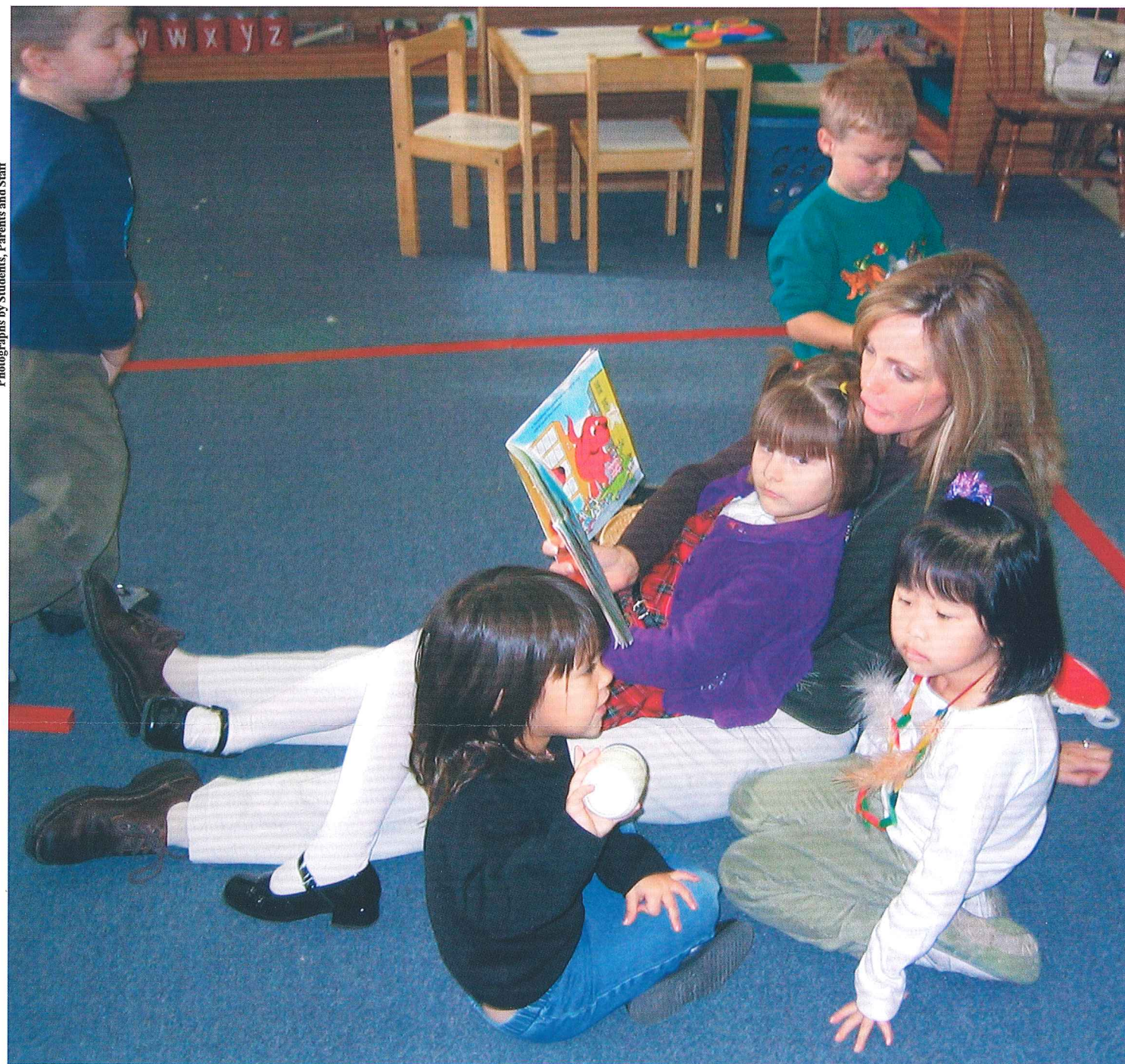
Photographs by Students, Parents and Staff