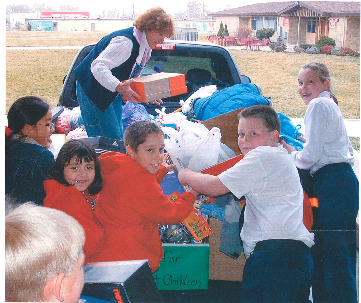
Photographs by Students, Parents and Staff